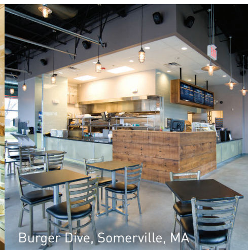
Burger Dive, Somerville, MA