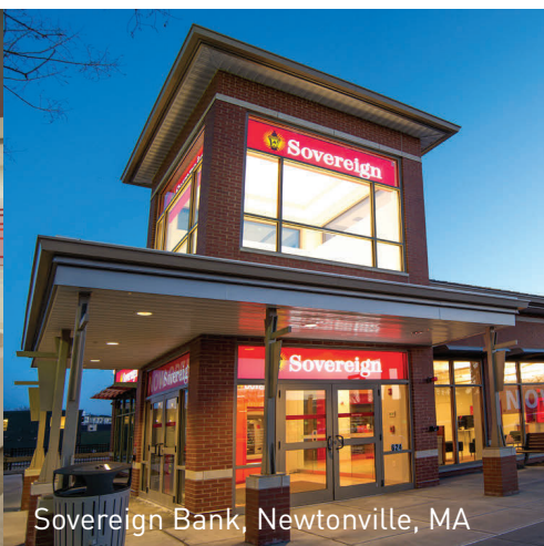
Sovereign Bank, Newtonville, MA