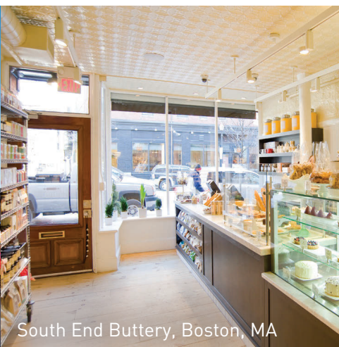
South End Buttery, Boston, MA