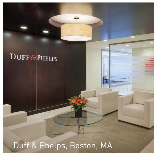
Duff &amp; Phelps, Boston, MA